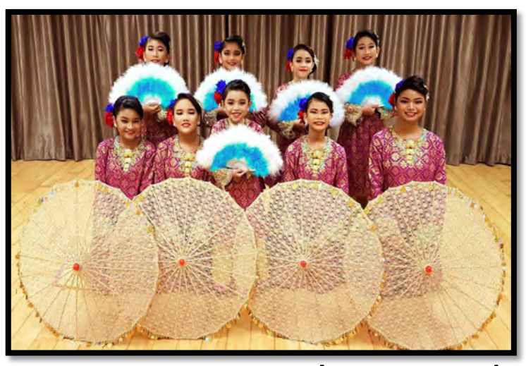
Singapore Youth Festival