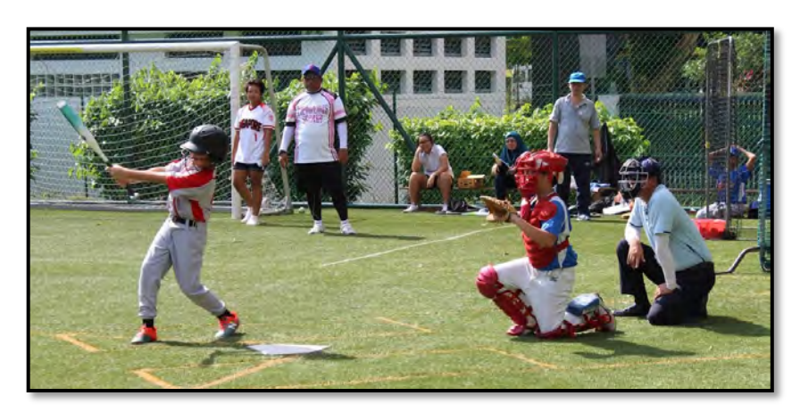
National Schools Games